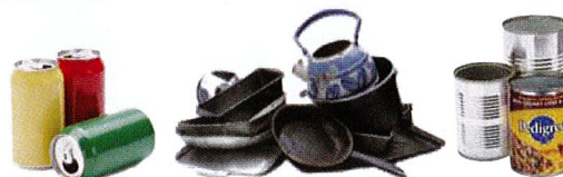
Aluminum Cans, Metal Cookware, Steel & Tin Cans