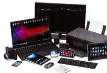
Electronics, Cords & Christmas Lights