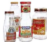
Clear Bottles & Jars