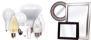
Light Bulbs & Plate Glass/Mirrors