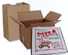
Cardboard & Pizza Boxes Flatten cardboard. Remove wax paper from pizza boxes