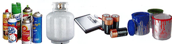
Aerosol Cans, Propane Tanks, Batteries & Paint Cans