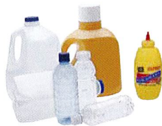
Jugs & Bottles with Small Top Openings