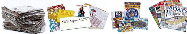
Newspaper, Office Paper, Paper Bags, Junk Mail, Paperboard & Magazines

Paper Place loose in cart. Use clear plastic bags for shredded paper ONLY .